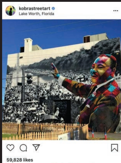
Martin Luther King Jr. in Kobra's Lake Worth, Florida, mural