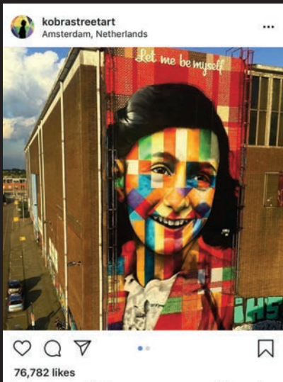
Kobra's portrait of Anne Frank in Amsterdam, the Netherlands